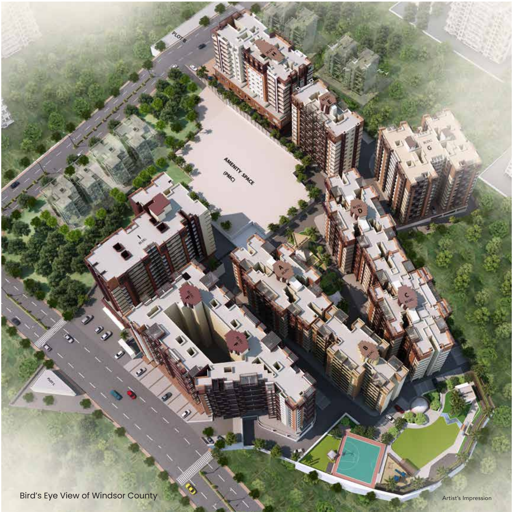
Bird's Eye View of Windsor County