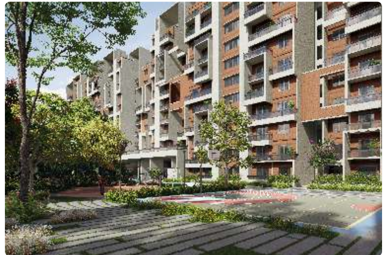
Rohan Abhilasha 3, Wagholi