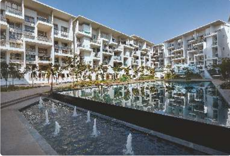
Rohan Kritika, Sinhadgad Road