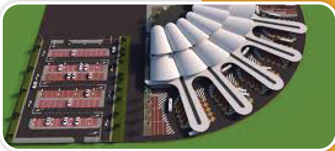
Overhauling Swargate Bus Stand