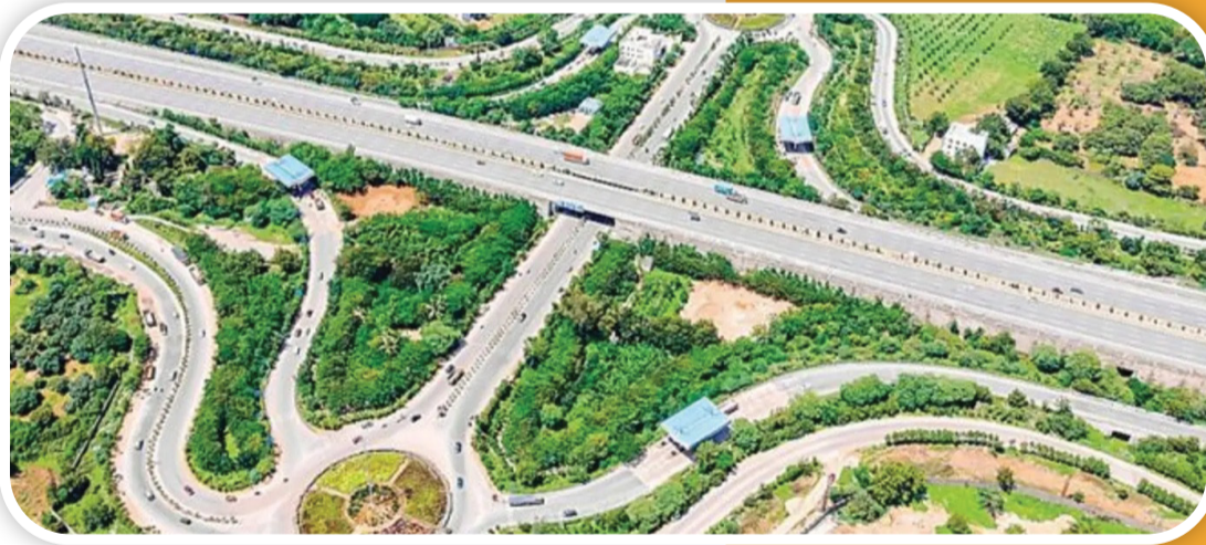
PMRDA Ring Road