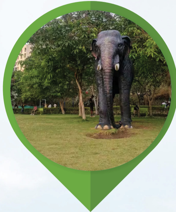
Pandit Bhimsen Joshi Udyan