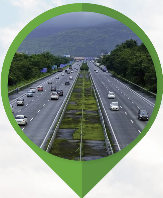
Pune-Bengaluru Highway (NH 48)