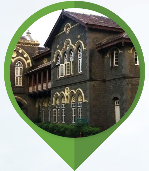
Fergusson College, Pune