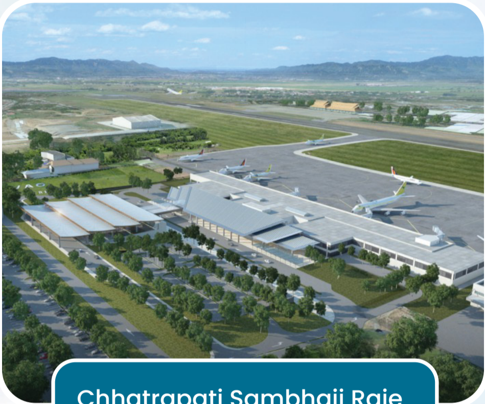
Chhatrapati Sambhaji Raje International Airport