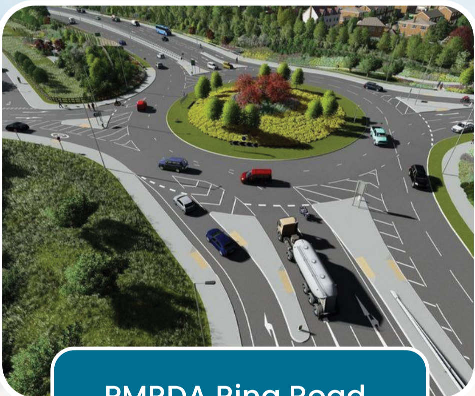
PMRDA Ring Road