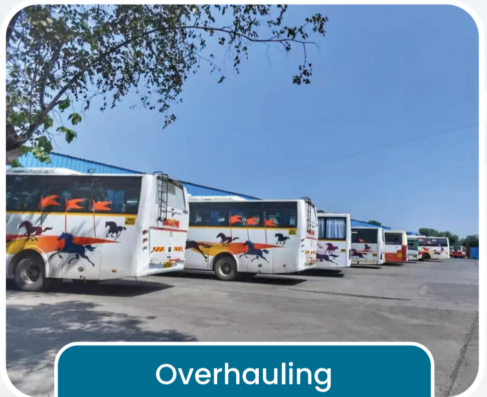
Overhauling Swargate Bus Stand