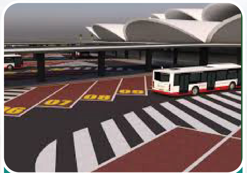
Overhauling Swargate Bus Stand