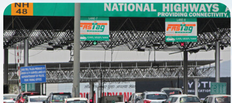
Khed-Shivapur Toll Plaza