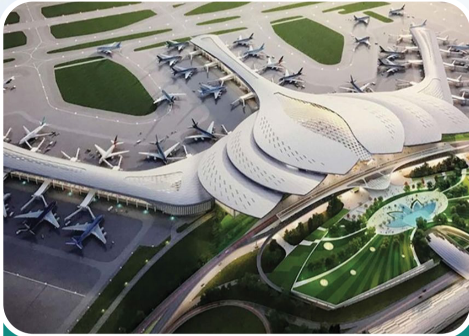
Chhatrapati Sambhaji Raju International Airport