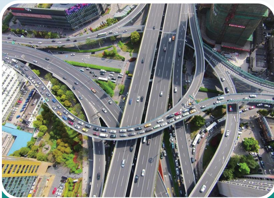
PMRDA Ring Road