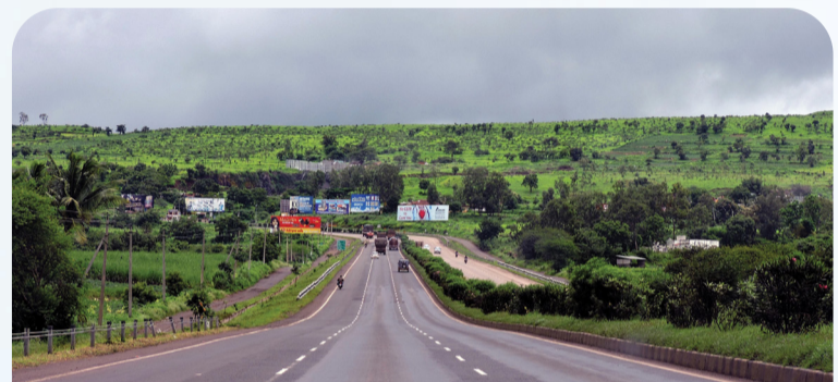
Pune-Bengaluru Highway (NH 48)